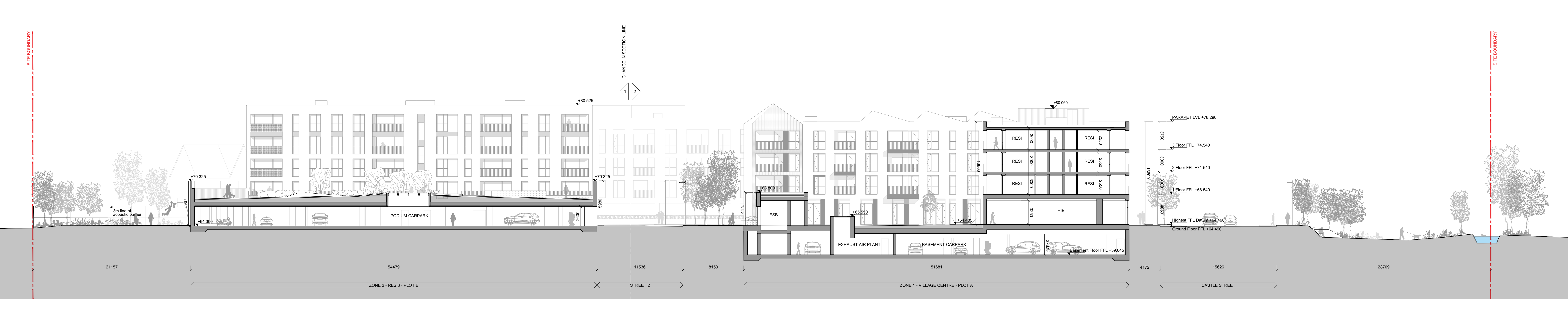
2 SITE SECTION C-C XX 303 SCALE: 1:200